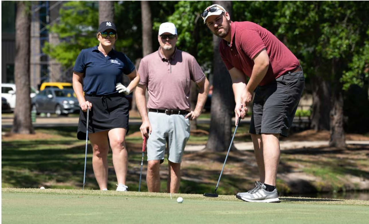
A 2022 golfer eyes his next shot as his teammates look on.