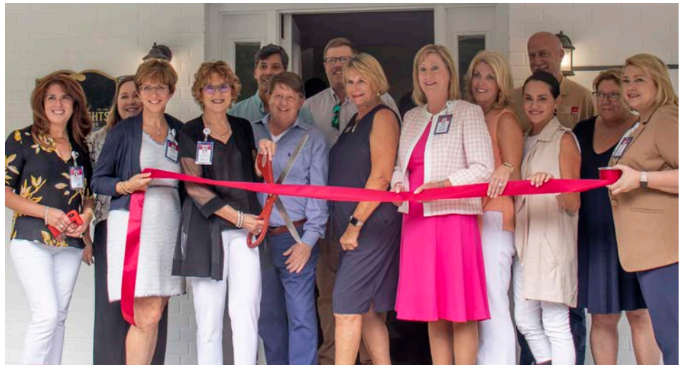
Dignitaries from St. Tammany Health System and New Heights cut the ribbon on the health system’s new Therapy and Wellness Clinic in Folsom, which will offer physical therapy, occupational therapy, speech therapy and hippotherapy.