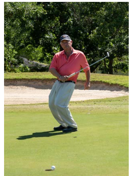
A golfer puts a little body English on his putt.