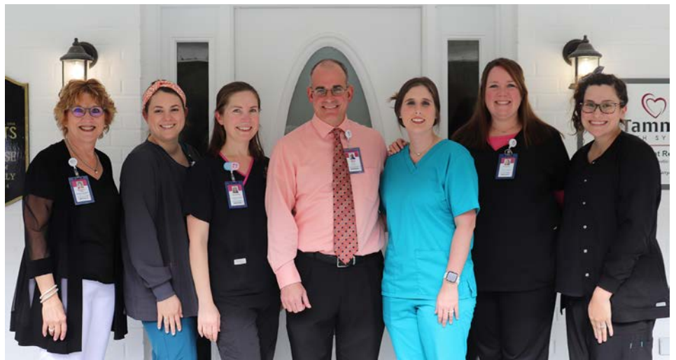
Members of St. Tammany Health System leadership pose with some of the staff of the health system’s new Therapy and Wellness clinic in Folsom.