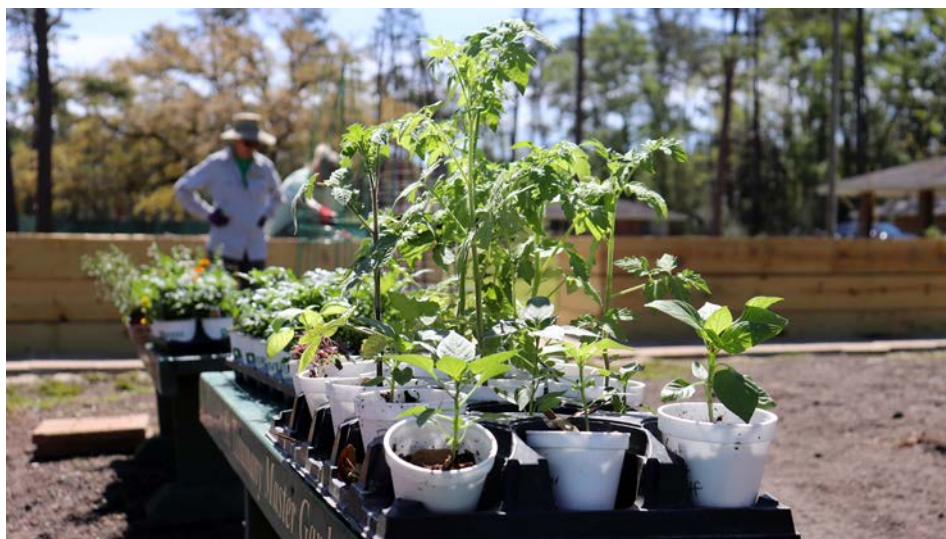
A variety of seedlings await planting during the construction of a community garden at Safe Haven in Mandeville, a project of the Healthier Northshore community alliance.

The garden, consisting of three raised beds planted with a variety of herbs and vegetables, will be tended and harvested by behavioral health clients living