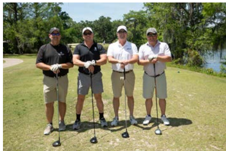
The team from PJ's Coffee took home the trophy as the first-place finishers of 2022.