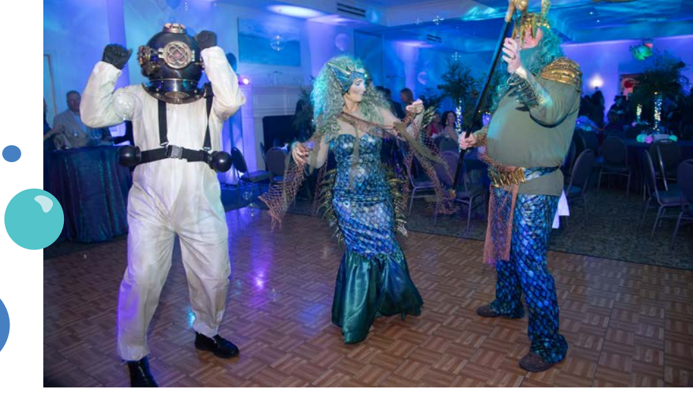
Some of the denizens of the deep cut a rug – or a reef? – on the Gala dance floor.