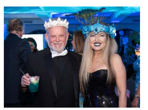
A toast to (and from) the undersea realm