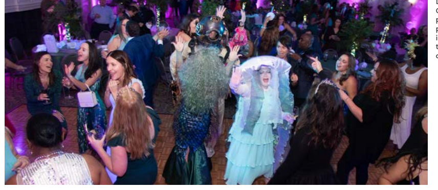
Do the swim! Gala auests sterior fins nev flood the