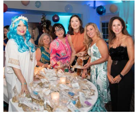
Attendees browse some of the hand-painted oyster shells created by local cancer patients to sell at the Gala to raise money for local cancer care. (Read more about the shells or page 12.)