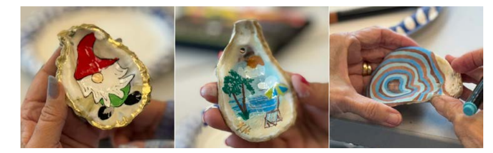
As part of a new art therapy program at St. Tammany Cancer Center - A Cancer of Ochsner Medical Center, patients and their caregivers were recently invited to paint oyster shells that will then be sold at THE Gala to raise money for similar cancer center programs.

art as a way to become self-aware and express what they are feeling."