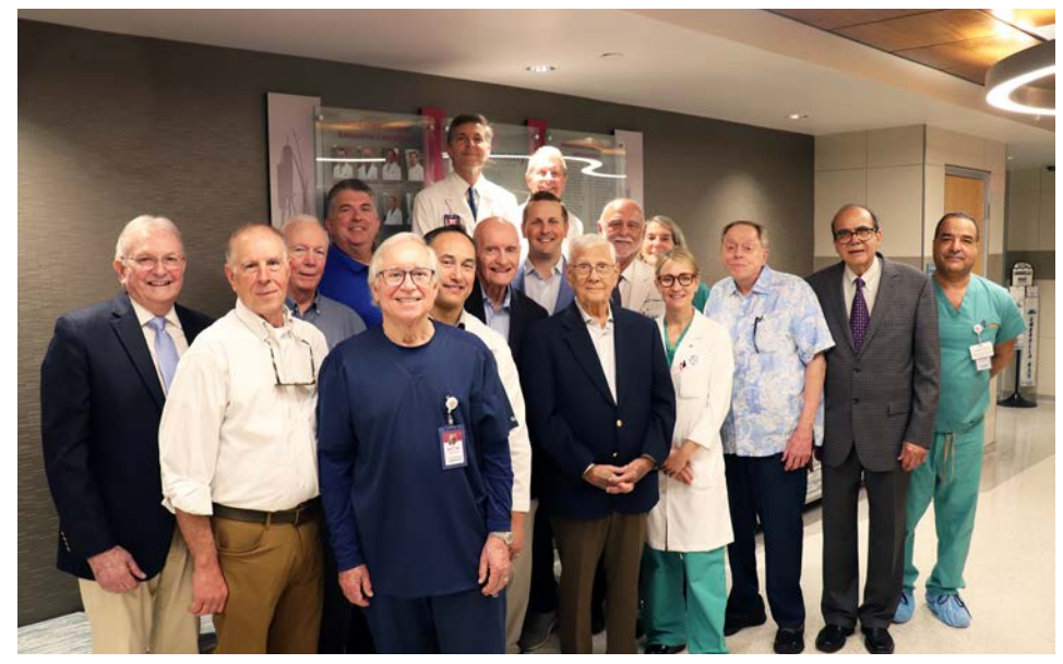
Northshore physicians who have served as chief of staff at St. Tammany Parish Hospital gather for a group photo on April 17 following the unveiling of an installation honoring those men and women who have held the position since the hospital's 1954 founding.

"This display will serve as a tribute and an inspiration to all of the physicians who practice at St. Tammany Health System to