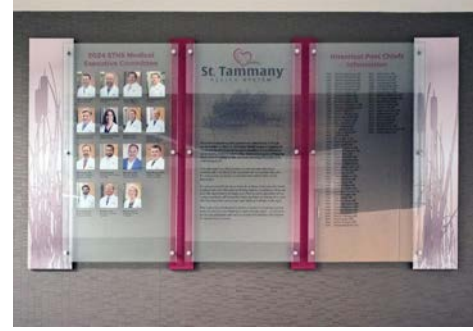
The new installation consists of three panels, including one dedicated to the current Medical Executive Committee and another that chronologically lists those men and women who have served as chief of staff at St. Tammany Parish Hospital.

In addition to listing the chiefs of staff, the installation – funded by donations to St. Tammany Hospital Foundation – includes a panel containing the names and photos of the health system's current Medical